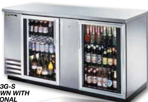
TBB-3G-S (SHOWN WITH OPTIONAL ORGANIZERS)